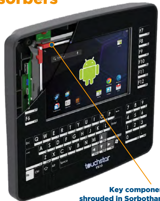
Key components shrouded in Sorbothane®

The TS73 is therefore capable of being used in robust environments providing an extremely reliable solution and prolonged life. On impact, the Sorbothane® rubber material deforms to disperse the shockwaves laterally, immediately returning to its initial form to be fully operational in time for the next impact.